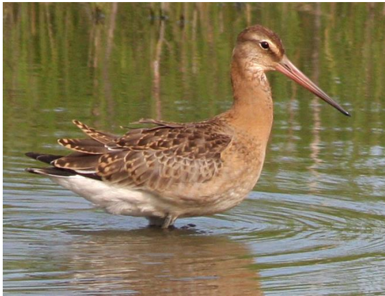
Black-tailed Godwit

Big east coast Thrush falls a fantastic natural spectacle with thousands of Redwings, Fieldfare, Eurasian Blackbird, Song Thrush and smaller numbers of Ring Ouzel. Black-tailed Godwit, Greenshank, green Sandpiper, Wood Sandpiper, Jack Snipe, Eurasian Woodcock, Rock Pipit, Brambling, Yellow-browed Warbler, Lesser and Common Redpolls, Short-eared Owl.