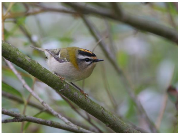
Firecrest

Scarce and Rare, seen on our Birding Discovery Days in last 3 years; Red-backed Shrike, Bluethroat, Firecrest, Rose-coloured Starling.