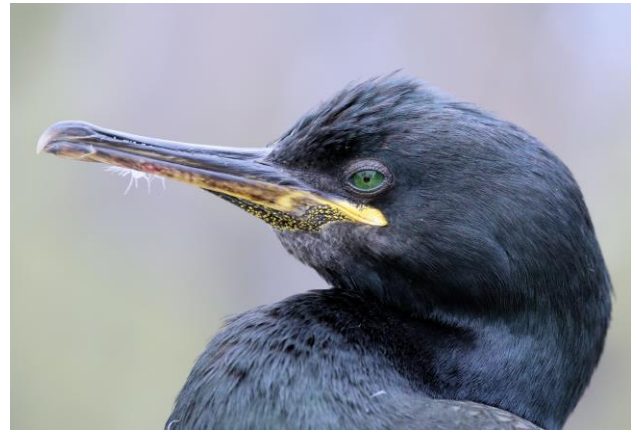
European Shag

Scarce and Rare, seen on our Birding Discovery Days in last 3 years; Red-backed Shrike, Bluethroat, Firecrest, Rose-coloured Starling.