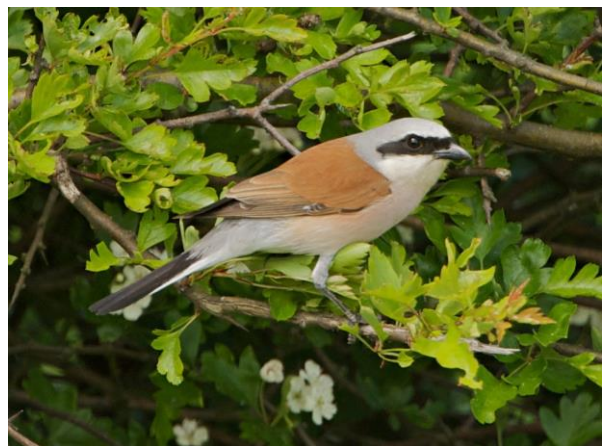
Red-backed Shrike © Steve Race