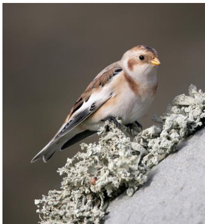
Snow Bunting

Great Northern Diver, Red-throated Diver, Snow Bunting, Lapland Bunting, Twite, Purple Sandpiper, Mediterranean Gull, Glaucous Gull, Iceland Gull, Eurasian Curlew, Common Redshank, Turnstone, many thousands of waders on the Humber Estuary including Grey Plover, Red Knot and Bar-tailed Godwit.