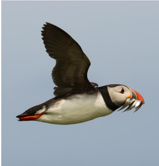
Atlantic Puffin

200,000 nesting seabirds; Atlantic Puffin, Guillemot, Razorbill, Northern Fulmar, European Shag, Northern Gannet, Black-legged Kittiwake. Barn Owl, Peregrine, Common Kestrel, Rock Pipit, Meadow Pipit, Eurasian Skylark, Eurasian Tree Sparrow, Corn Bunting.