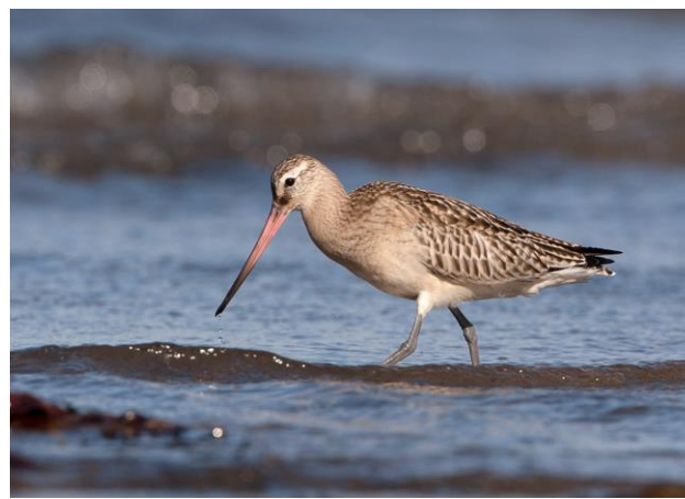
Bar-tailed Godwit

Scarce and Rare, seen on our Birding Discovery Days in last 3 years; Red-necked Grebe, Little Auk, Grey Phalarope, Bohemian Waxwing, Black-throated Diver, Shore Lark, Desert Wheatear, Rough-legged Buzzard