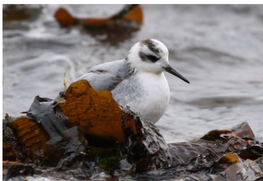
Grey Phalarope

Scarce and Rare, seen on our Birding Discovery Days in last 3 years; Red-necked Grebe, Little Auk, Grey Phalarope, Bohemian Waxwing, Black-throated Diver, Shore Lark, Desert Wheatear, Rough-legged Buzzard