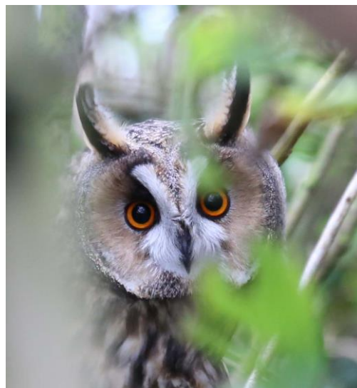
Long-eared Owl