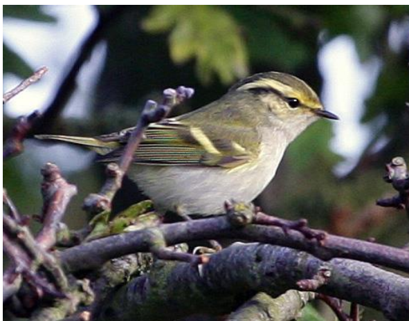
Pallas's Warbler

Scarce and Rare, seen on our Birding Discovery Days in last 3 years; Curlew Sandpiper, Long-eared Owl, Great Grey Shrike, Pallas's Warbler, Richards Pipit, Red-breasted Flycatcher, Siberian Chiffchaff, Siberian Accentor.